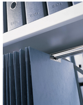
ZT pendel frame