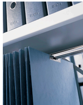
ZT pendel frame