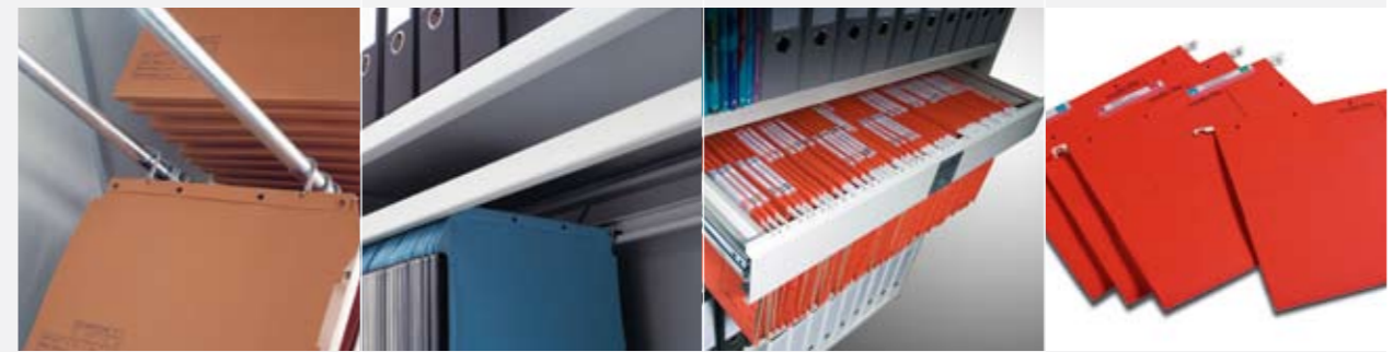
l'Oblique / TUB frame LF frame Pull-out frame Multi-file

Use as a writing desk, work table or temporary storage of smaller goods. For shelving systems with 250 to 450 mm nominal depth. Store smaller goods either loose or packed. The drawer may be divided into a number of 55 mm sections, at multiples of 55 mm, using 2 retainers and the required number of partitions. For shelving systems with 300 to 450 mm nominal depth. To store documents in Jalema/Zippel suspension files. For shelving systems with 350, 370, 390, 400 and 450 mm nominal depth. To store Jalema CD rom pocket files. For shelving systems with 200 mm nominal depth. Store documents in Elba/Leitz/Pendex suspension pocket files. For shelving systems with 350, 370, 390, 400 and 450 mm nominal depth.