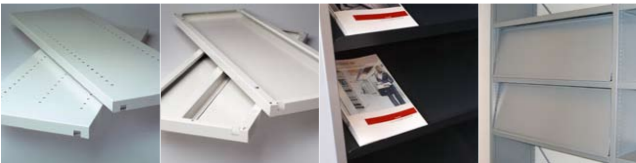
Shelf perforated 2 and 3 rows Reinforcement bar Display shelf Foldable display

Use with solid dividing bars or steel partition panels to create sub-compartments. Increase the maximum permissible shelf load for steel shelves with nominal depth 350 mm and more. Display shelf is used to present documents. The foldable display combines the function of display and storage.