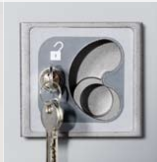
Sliding doors and roller front doors