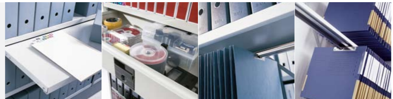
Pull-out shelf Drawer ZT pendel frame for lateral suspension files and CD rom Elba pendel frame

Make a positive stop along the front or back edge of a shelf. Create an upright edge between two shelves. For use in double racks only. To create a stop along the front of a shelf. To identify aisles.