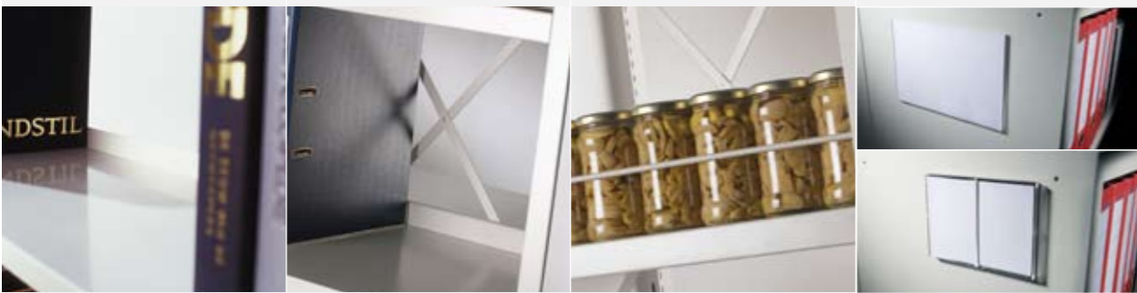
Shelf stop Middle stop Front stop Label holder A5 / A6

Use with solid dividing bars or steel partition panels to create sub-compartments. Increase the maximum permissible shelf load for steel shelves with nominal depth 350 mm and more. Display shelf is used to present documents. The foldable display combines the function of display and storage.