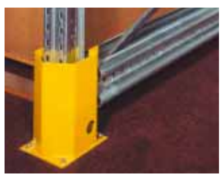
Productivity and safety are increased by the use of high visibility upright guards and guide rails.