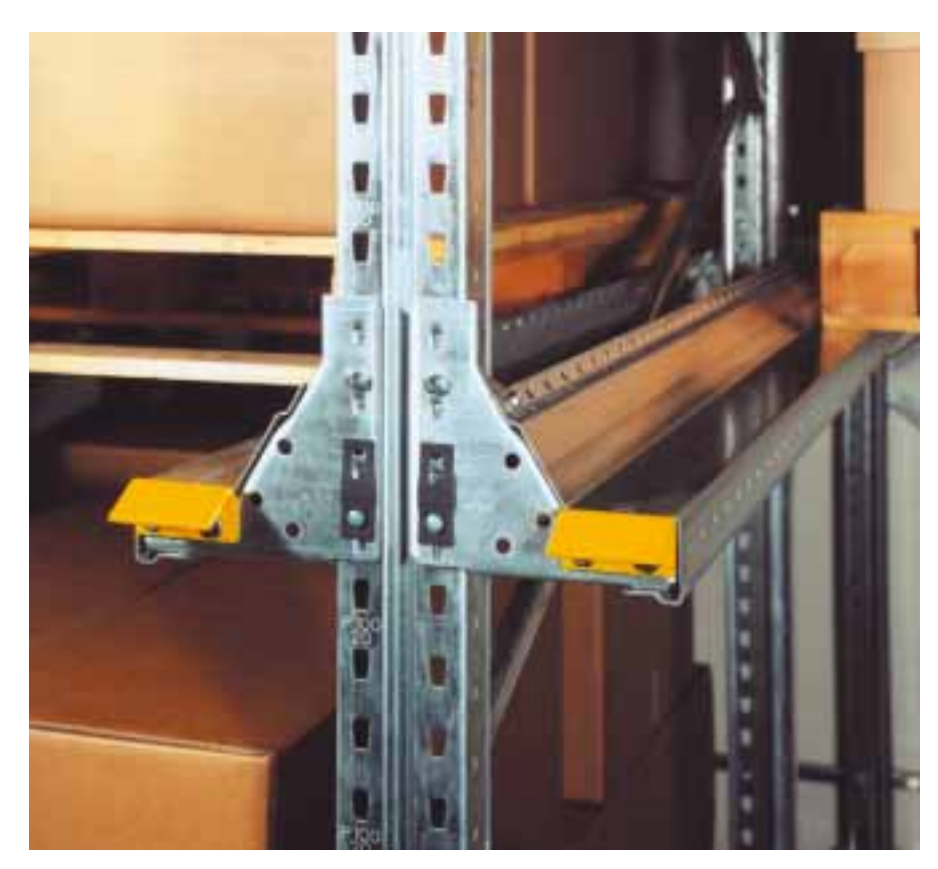
The smoothly formed pallet-carrying rail offers a safe, snag free surface. Pallet rails are carried on brackets that slot into the upright at 50mm pitch and are pin-locked in position.

Top and rear braces ensure excellent stability.