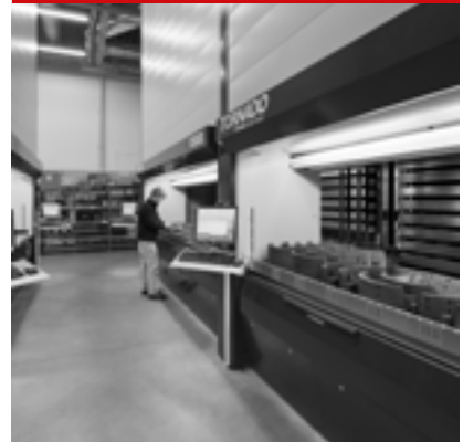
Storage Machines - Tornado