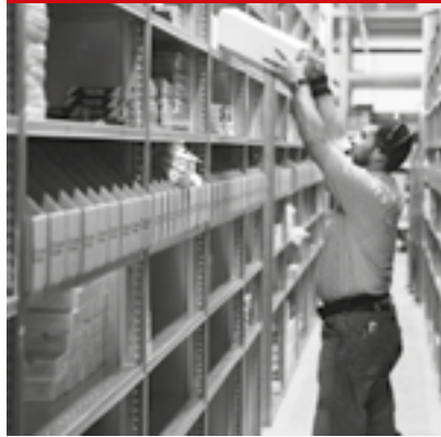
Shelving - HI280