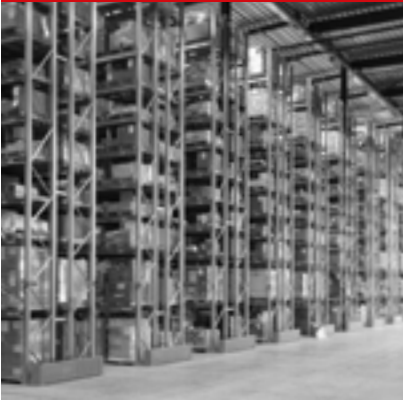
Pallet Racking - P90